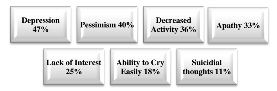
Figure 2. Frequent signs of stress disorder

Frequent signs of stress disorder in servicemen after injury were feelings of depression -47% (22), pessimism -40% (18), decreased activity -36% (17), apathy -33% (15), ability to cry easily -18% (8), recurrent suicidal thoughts 11% -(5), lack of interest -25% (12).