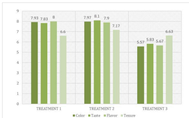
Figure 3. The General Acceptability Level in Terms of Color, Taste, Flavor, and Texture among Expert Panelists