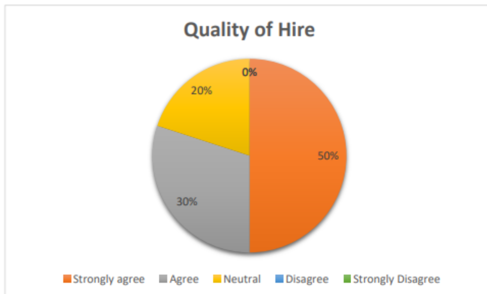
Figure 3: Quality of hire from RPO

In addition to saving money, outsourcing recruiting may improve the quality of hiring by allowing you to choose from a larger pool of qualified individuals. Here, data shows that 80% of respondents agree that outsourcing provides good quality candidates for the organization, with 50% of recruiters strongly agreeing that recruitment outsourcing leads to increased quality of hire and 30% of recruiters agreeing with this statement. If nobody has chosen the disagree or strongly disagree option, it's safe to assume that outsourcing recruiting is widely seen as a positive practice [24].