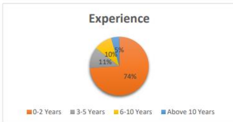
Figure 1: Experience of respondent in RPO firm

top talent) is accepted, and the null hypothesis is rejected [20-21].