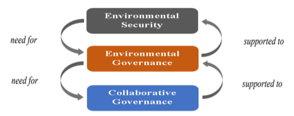
Figure 1 Relationship between Environmental Security, Environmental Governance and Collaborative Governance

Collaborative governance is an idea of the need for cooperation between stakeholders in solving a problem. Ansell and Gashl (2007) define collaborative governance as governance by involving many stakeholders in the collective decision-making process, consensus-oriented and deliberative, and aims to make or implement public policies or manage programs and public assets. In the perspective of environmental governance, collaborative governance is an inseparable part of environmental governance efforts to ensure the sustainability of environmental protection programs or environmental security (Figure 1).