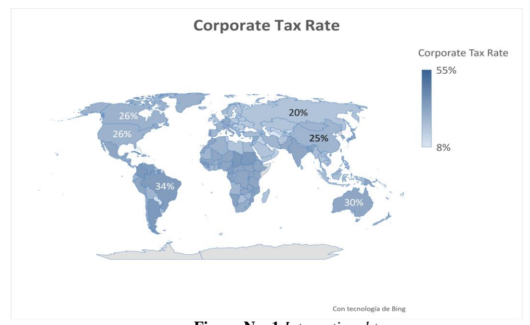
Figure No. 1 International tax

In the different countries, the tax rates for companies are determined, of which the tax rate varies by country, which makes it complex when determining a planning by region, in its entirety, the taxable base of the tax on society falls through taxes taking into account the deductions of costs and expenses fiscally allowed, in turn the regulations contemplate the tax surcharge.