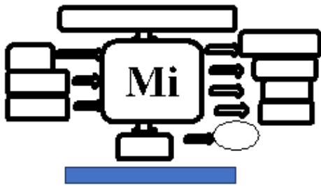
Block Diagram for Vehicle Security at Parking Areas along with Child Presence Detection in vehicles over IOT.