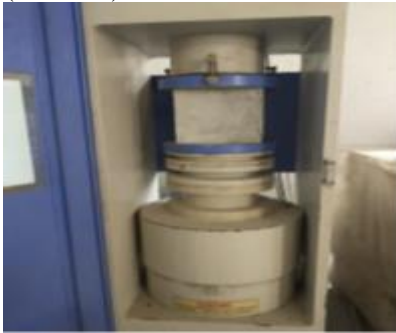
Fig-4.2. Specimen loaded into testing machine

10. Concrete cube average compressive strength=(load/area)