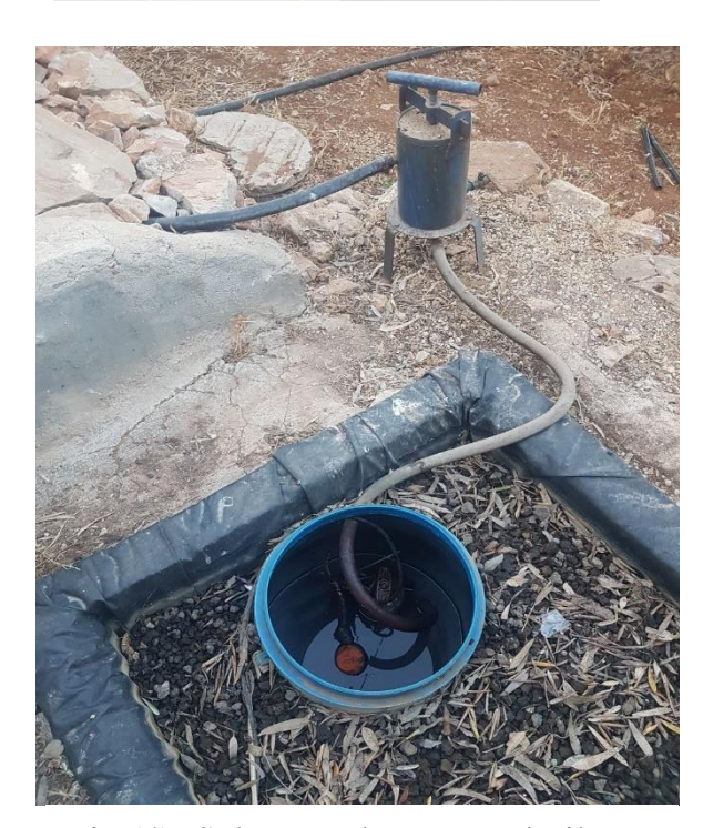
Fig (4): Submerged Pump and Filter