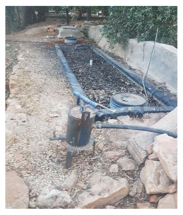
Fig (3): Greywater Station