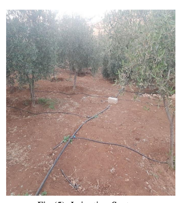
Fig (5): Irrigation System