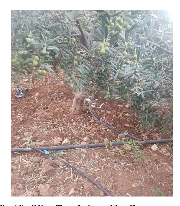
Fig (6): Olive Tree Irrigated by Greywater

Third topic: Agriculture from an Islamic perspective.