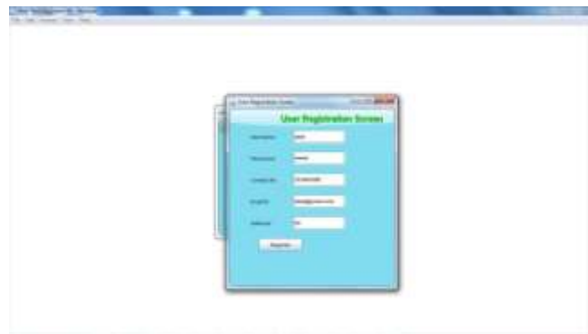
Fig 4.5 Click On Register for User Registration