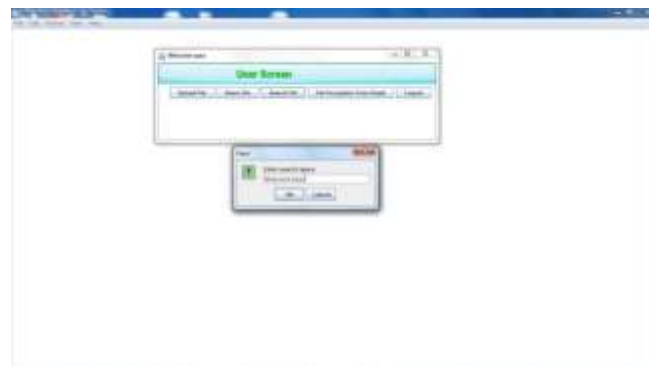
Fig 4.7 User Search Query Screen