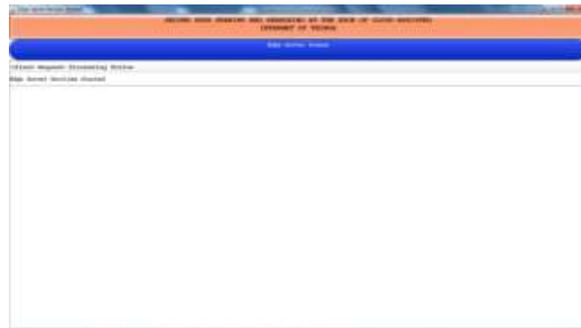
Fig 4.2 Edge Server