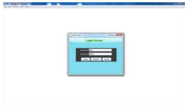
Fig 4.6 Login as Registered User