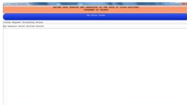
Fig 4.3 Key Generator Server