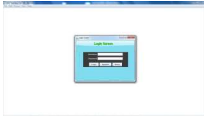
Fig 4.4 Smart Device Application