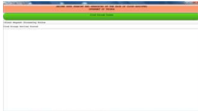
Fig 4.1 Cloud Server