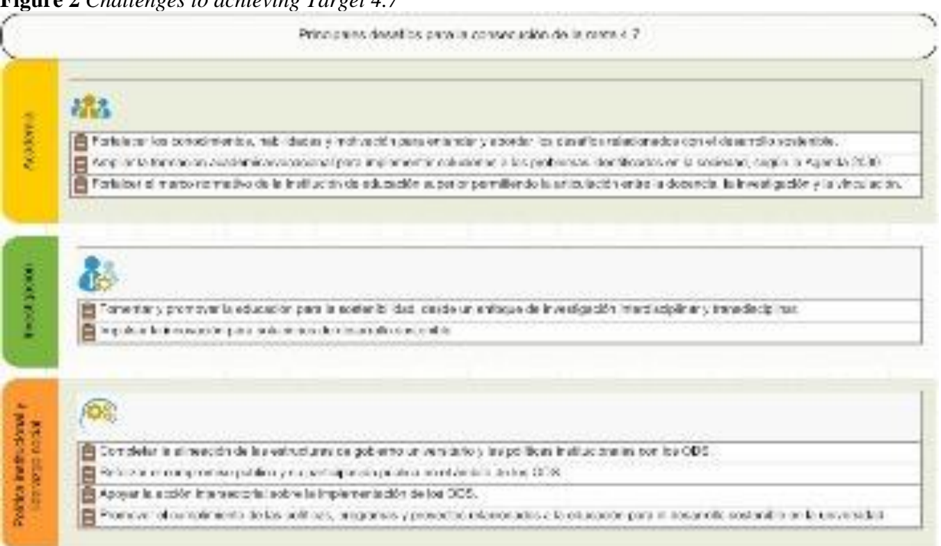
Figure 2 Challenges to achieving Target 4.7

Note to figure: Prepared from Figure 1 of the present research and the How to start SDGs in universities guide (SDN Australia/Pacific, 2017).