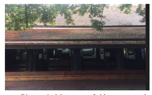
Picture6: Museum of khanon temple by

Knowledge gained from research .The researcher has created a model is SIAM.The meaning of model as follow: