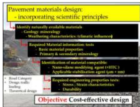
Figure 1: Recommended basic approach to road pavement materials design incorporating scientifically based concepts, developed for the selection of a material material compatible Newage (Nano) Modified Emulsion (NME) stabilising agent addressing the engineering requirements (physics) of a road pavement structure

Basic inputs such as traffic loading, required as part of pavement structural design, will, of course, be part of the pavement design process and is not affected by the concepts discussed in this paper. Traffic loading is used to design a pavement structure with material layers meeting the engineering requirement to ensure that the predicted traffic loading will be carried, taken into consideration the risk profile of the category of road [21]. The main objective in the approach presented in Figure 1 is to ensure that the naturally available materials are utilised to their full potential using available, proven, safe and applicable material sciences in designing the most cost-effective road infrastructure at a minimum risk without compromising fundamental engineering principles.