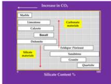
Figure 3: Silicon content variation versus Carbon-di-oxide content found in some typical and commonly known naturally available materials

The distinction between Silicate and non-Silicate and Silicon-poor materials is of importance as it forms the basis for the design and selection of an applicable effective NME stabilising agent. High percentages of other minerals such as Calcium Carbonates ( \text{CaCO}_3 ) in the material to be stabilised will require a different modification in terms of a Hydroxy Conversion Treatment (HCT) [3,11] in order to provide high strength “permanent” bonding of the stabilising agent with the available elements in the material to meet engineering requirements.