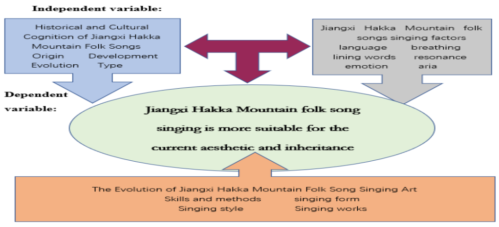
Figure 2: Research Conceptual Framework

Jiangxi Mountain folk song singing is more suitable for the current aesthetic and inheritance development