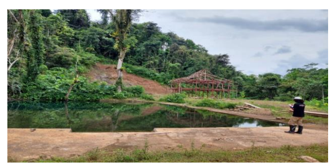
Figure 3. Location of Baths in Walandawe Village Res Militaris , vol.13, n°3, March Spring 2023

Tourism Aspect , the potential tourist areas in Routa District that can be developed in Routa District are natural and mountain tourism, such as natural tourism of the Lasampala and Hiuka mountain complex, Lalomerui waterfall, and lakes in Walandawe and Lalomerui Villages. In addition to the natural tourism places, other tourism potentials are cultural reserves or relics for cultural tourism and local wisdom, such as Kampung Tua Routa in Wawo Polihe, Old pre-Islamic cemetery in Matambolihe; Polihe Fort or O'ou Fortress; Paruponti and Batubarang Caves in Tirawonua and Damar Tree Area.