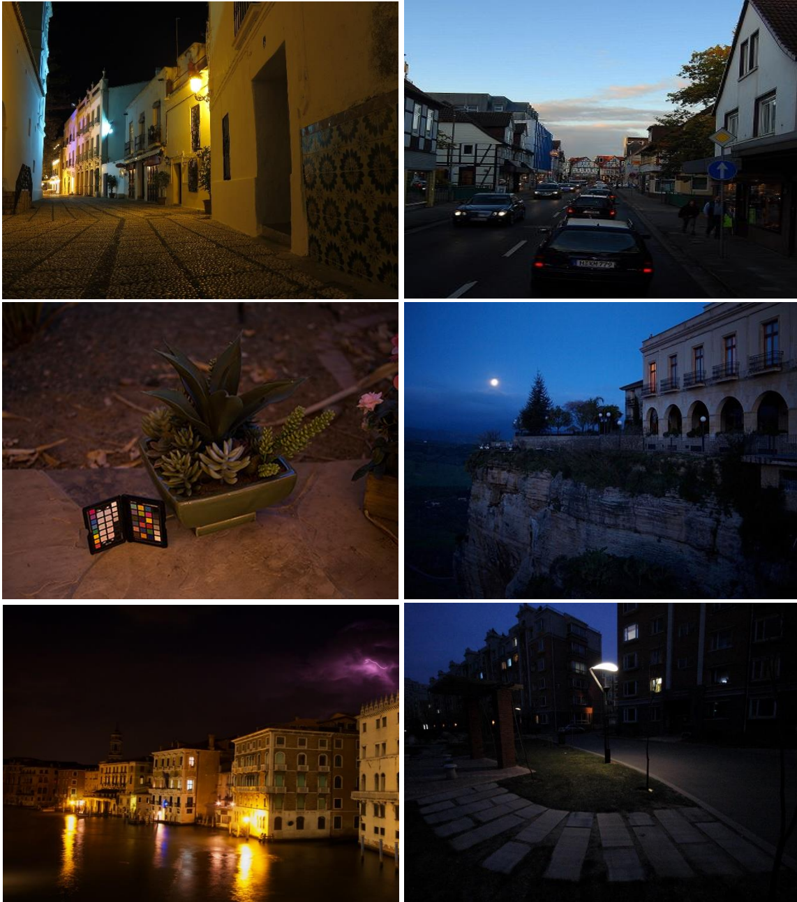
Figure 1: Sample low-light images fed to the proposed model.