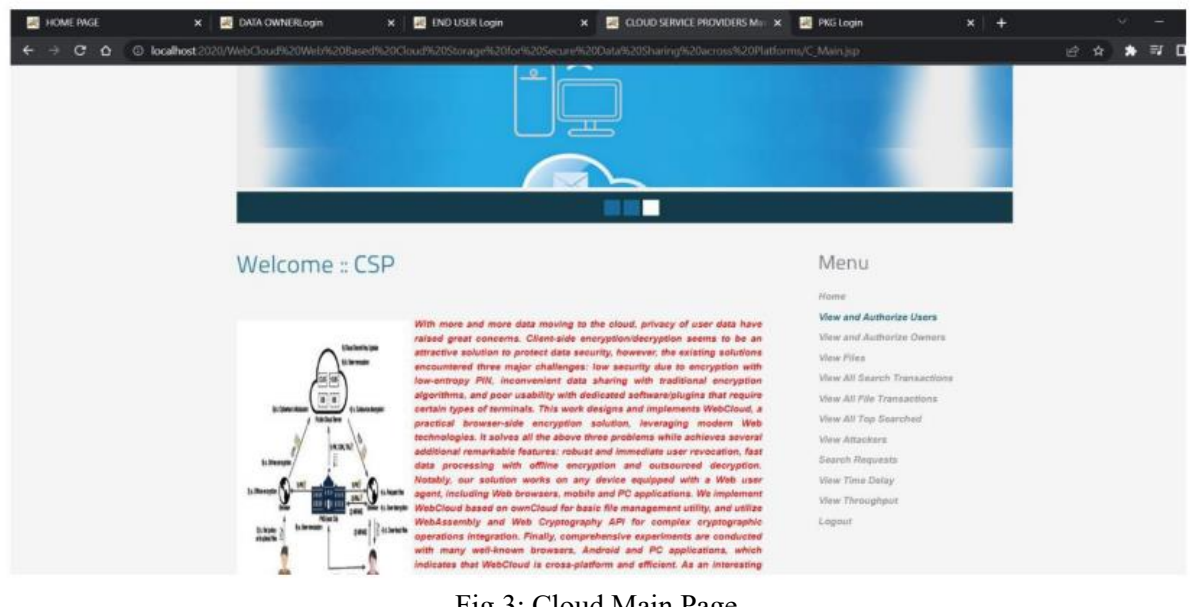
Fig 3: Cloud Main Page.