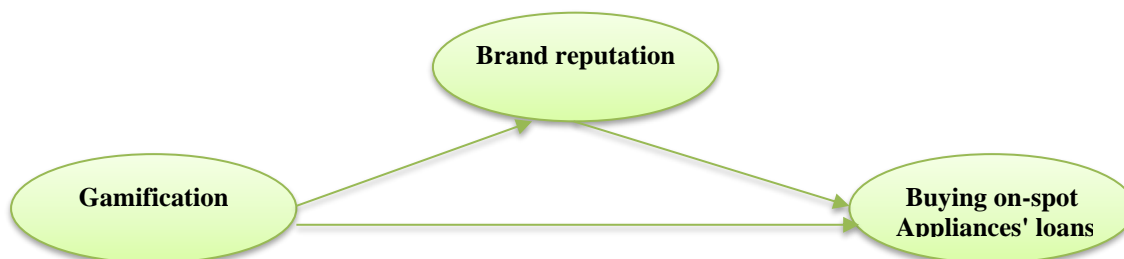
Figure 1 - Conceptual model of research