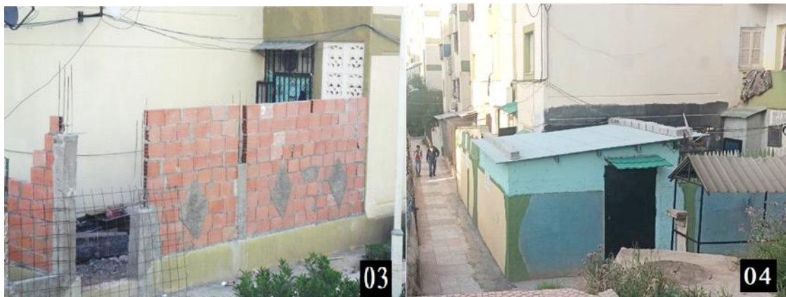
Bilal Aouadja 2015