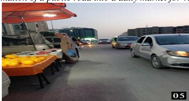
Image 6: Using a sidewalk as a daily market for selling used items.