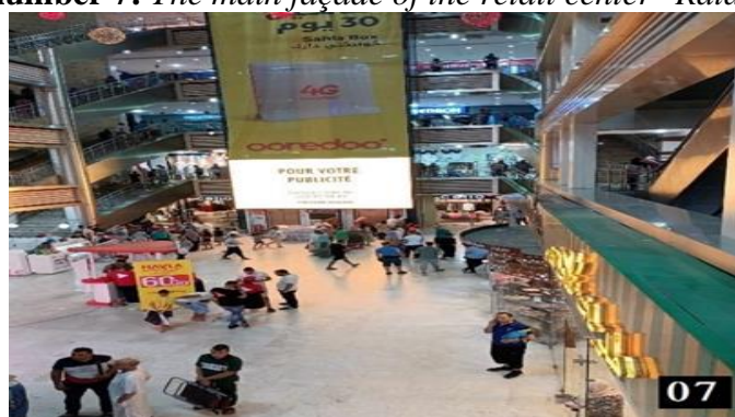
Image number 7: The main façade of the retail center "Ratage Mall."

Today, the commercial structure in the new city has become characterized by diversity and abundance, allowing residents from vulnerable neighborhoods to choose from several shopping centers. They are no longer compelled to resort to chaotic markets or irregular selling points because these commercial centers, in order to maintain their competitiveness, now offer them upscale services, thanks to the abundance of goods and the attractiveness of their decorations and diverse atmospheres (covered commercial alleys, vibrant lights, luxurious facades). These centers include various amenities such as dining areas, prayer spaces, and play areas. (Image number 08, 07)