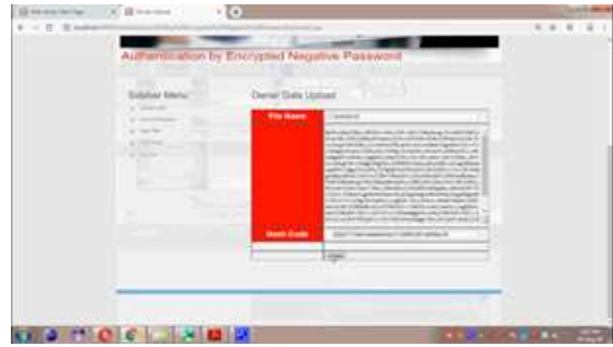
Fig 4:Data Upload Page