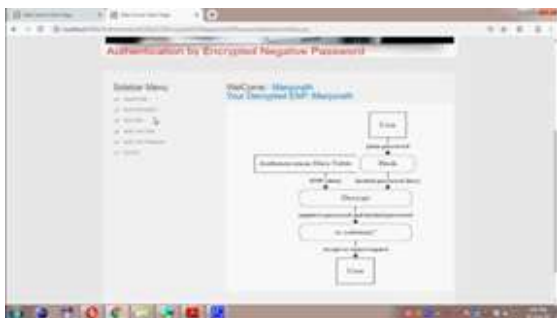
Fig 3:Home Page