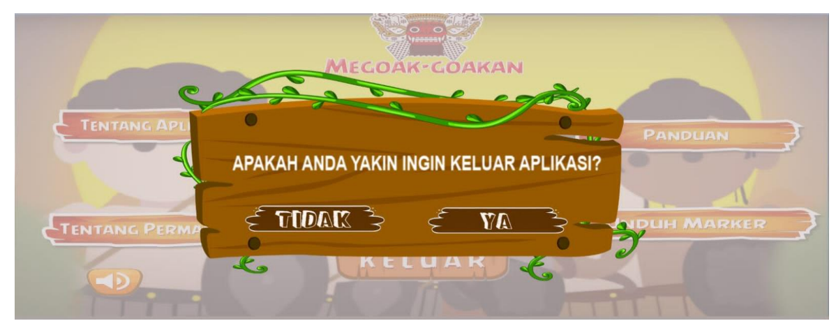
Figure 4. AR Megoak-goakanExit Display