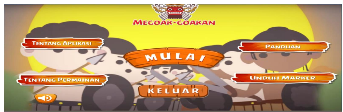
Figure 3. Main Menu Display

Suggestions given by media experts are that on the menu how to use new scenes are added so that they do not need to be connected to the internet, complete short descriptions and videos of the use of media that will be used for the publishing process. The following is an Augmented Reality multimedia display on the subject of the Megoak-goakan game that has been developed: