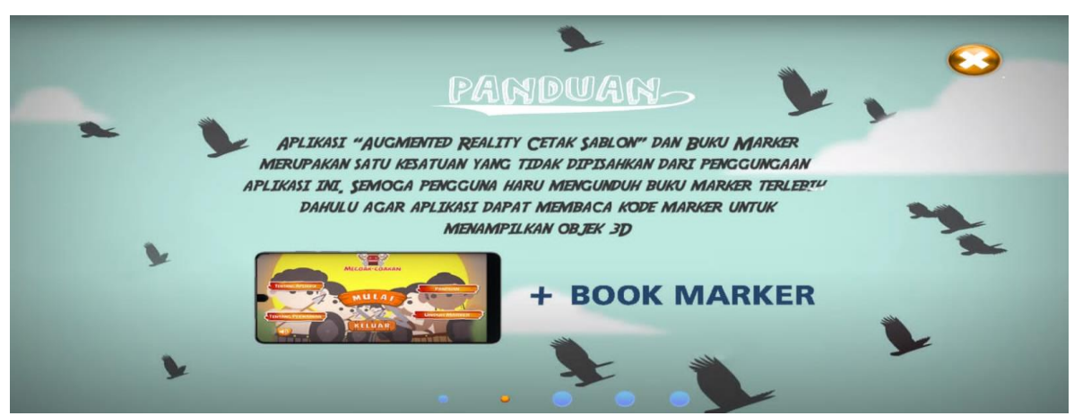
Figure 4. Instruction Guide Display

Res Militaris, vol.12, n°3, November issue 2022