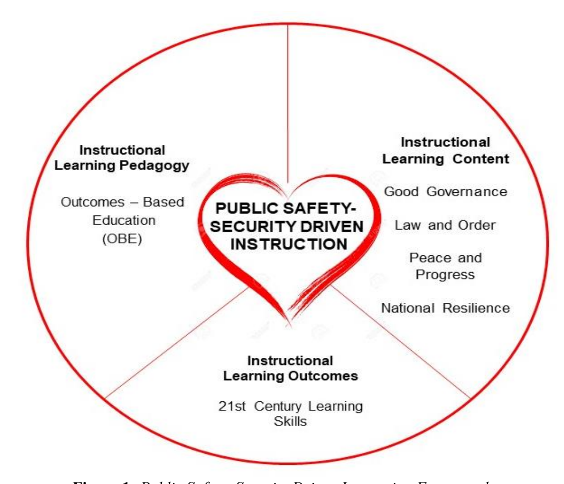
Figure 1: Public Safety- Security Driven Instruction Framework