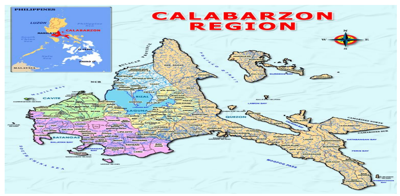
Figure 2. Map of CALABARZON (taken from

Coco Festival of San Pablo City, Laguna. Data gathering was conducted from July to October 2021.