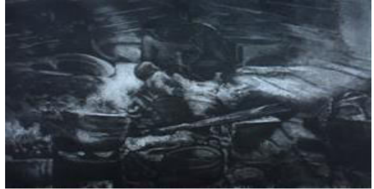
Figure 3 Staying in the Fire

The researcher produced a series of eight paintings to preserve Isan ethnic identity: figures 3-7 reflect Heet 12 customs, figure 8 illustrates the belief in apparitions, and figures 9-10 portray Kong 14 traditions.