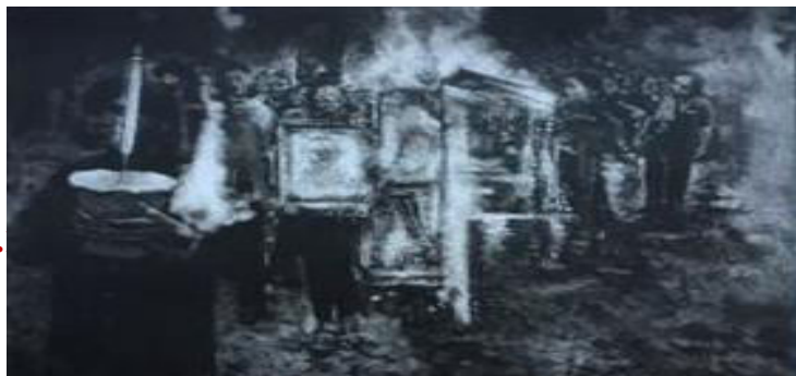
Figure 9 depicts the "Kin Dong" painting. A traditional Thai-Isan wedding feast known as Kin Dong marks the start of a new chapter in one's life. The purpose of this wedding is to pay tribute to the cord that has tied the couple throughout their prior lives. The rope also stands for the fusion of both families' and ancestors' energies from this life and earlier incarnations.