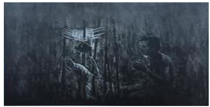
Figure 6 Phi Ta Haek

Figure 5 depicts the "Bun Khao Pradabdin" painting. The image shows the ceremonial for the ninth month. Isan people participate in this traditional ceremony by placing rice, fish, savory food, fruits, betel nuts, and cigarettes in krathongs at the base of a huge tree, on the ground near a pagoda, or in a church. They do this with the intention of earning merit for the dead, as well as for the devil or the creatures of the underworld.