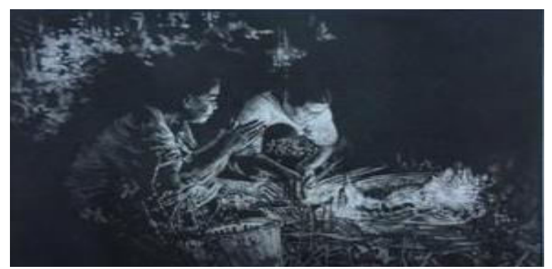
Figure 5 Bun Khao Pradabdin

Figure 4 depicts the "Bun Phra Wet" painting. It is also known as the ritual for the fourth lunar month which honors the highest virtue—giving oneself up for the good and enjoyment of all people. Because of this, asceticism is practiced by the indigenous population as a ritual ceremony.