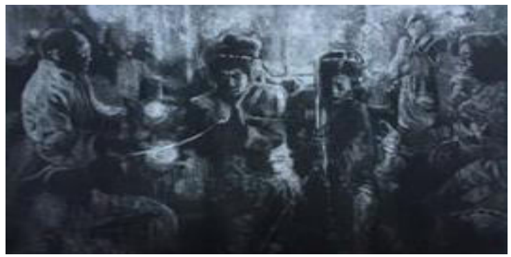
Figure 9 Kin Dong

Figure 8 depicts the "Losing Luck" painting. It was influenced by their apparitional beliefs. It was influenced by their apparitional beliefs. Ghosts and apparitions are still hugely significant to humans, especially the sick and suffering, because they are representations of magical powers. It is a sacrifice that links the chanting of good luck to the worship of the ghosts of fate by using a nine-chambered krathong, or a buoyant, ornamented basket. The patient is said to receive excellent health and fortune as well as having their bad luck disappear thanks to this offering.