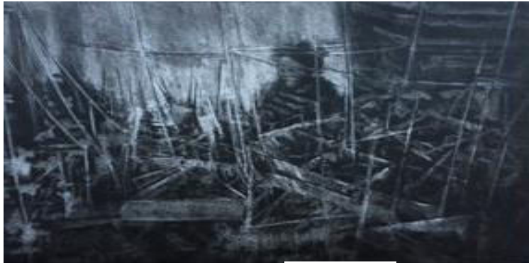
Figure 8 Losing Luck

Figure 6 depicts the "Bun Kathin" painting. The villagers consider it to be of great value that they give the Buddha his robes at this 12th month rite. Kathin's body is three times paraded to the shrine in this painting. They then participate in the Kathin robe offering rite alongside the monks.