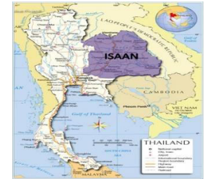
Figure 2 Map of Northeast Thailand (Chris, 2017, February 20)

the Khorat Plateau and is bordered by Laos, Thailand, the Mekong River, and Cambo dia. To the west, it is divided from northern and central Thailand by the PhetchaBun Mountai ns. The area in northeastern Thailand is made up of 20 provinces, as shown in Figure 2.