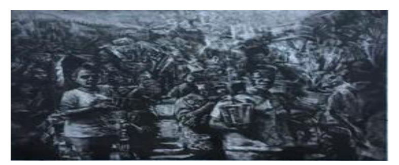
Res Militaris , vol.12, n°6, winter 2022

Figure 6 depicts the "Phi Ta Haek" painting. The design of this artwork was influenced by the Khaosak ceremony, which is held in the ninth month and honors Phi Ta Hak for the prosperity of their farming since Phi Ta Haek is thought to be the ghost of the rice fields and is thought to produce crop proliferation.