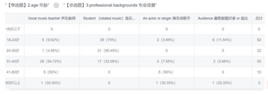
Table 1 Age and Professional Background Distribution of the Sample

To obtain valid and reliable studies, four research questions were answered using three tools. First, questionnaire surveys and semi-structured interviews with vocal teachers were used to collect their understanding of the character characteristics of Adina and Norina. Secondly, the students 'questionnaires and their group interviews were selected to find a breakthrough in character shaping by investigating the students' learning attitude and their understanding of the character characteristics during singing. Third, through the network video and film and television literature, analyze how to depict the characters through skills.