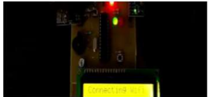
Figure 3 Connecting to Wi-Fi

The diagram encompasses the system's name and illustrates how the Arduino is connected to each sensor upon activation. The system is currently linked to Wi-Fi in order to notify the designated individual who has been designated to assist in the event of an emergency.