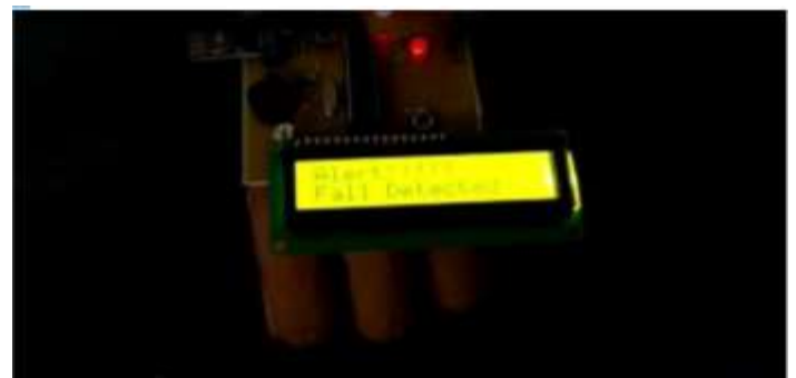
Figure 4 Fall Detected

The system is now capable of identifying incidents caused by human actions. As illustrated in the accompanying image, the apparatus emits an alarm.