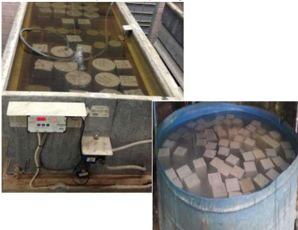
Figure 4 illustrates the presence of cubes inside a curing tank.