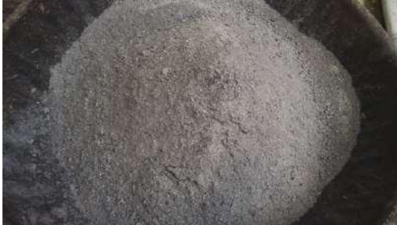
Figure 1: Sample of Grit

🌈 The third lot consists of a mixture of 50% river sand and 50% grit. The concrete cubes were produced using conventional molds with a mix design ratio of 1:2:4 and water-to-cement ratio (w/c) values of 0.35, 0.45, and 0.60. The measurement of the slump of the wet concrete was conducted in accordance with the requirements provided in the BS 1881: Part 102 (1983). Three cubes (150x150mm) were cast for each kind of fine aggregates, following the guidelines outlined in BS 1881: Part 108 (1983). Following a single day of casting, the concrete cubes were extracted from the mold and then placed in a water tank for the purpose of curing until the specimens are deemed suitable for the test of compression.