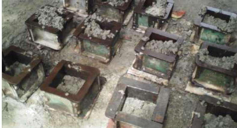
Figure 3 illustrates the process of placing concrete into cube moulds.