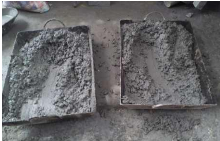
Figure 2 displays a sample of a concrete mix.