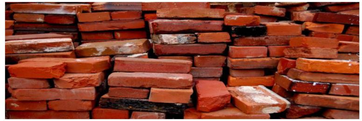
Figure 1- Cigarette Butt Bricks

(i) Use of Cigarette Butts in Production of Bricks- According to Dziadosz & Kończak stated that Innovation in construction materials produces a lighter, effective and efficient bricks from a cigarette butt. figure 1 shows a brick produced from cigarette butt.