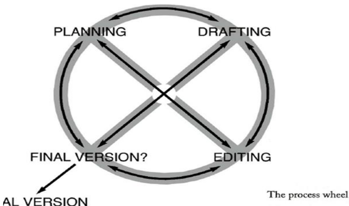
Figure (2.1), which are described as follows:

According to Jeffrey (2016: 3-5), writing ability is divided into five categories (see