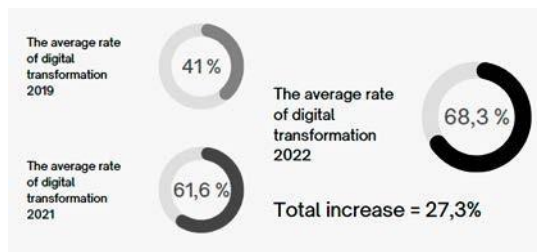
Figure1. The median rate of digital change of small and medium-sized enterprises (SMEs) in the industrial sector.

The accompanying figure, Figure 2, shows the average pace of digital transformation for each BM Canvas building component for the years 2019, 2021, and 2022. At this time, the Key Activities block has the highest percentage of digital content, which is 79.61%. The rate of digital transformation in customer service is likewise rather high, coming in at 79.44%. The Key Partners in Business block has the lowest level of digitization, coming in at 60.44 percent.