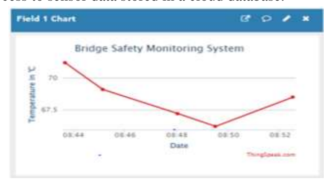
Figure 2: thingspeak graph for temperature sensor

The vibration, temperature, and ultrasonic sensors provide companion monitoring results. We create communication channels in the "cloud" to receive data detected by sensors. Graphics are used to show the results. Figures 2, 3, and 4 show several sensor readings saved in a "cloud database." Additionally, the water level in the system and the condition of the bridge were evaluated. In the event of an emergency or when data volume exceeds a specified threshold, the GSM module sends the necessary information to the cloud database. The cloud interface allows remote access to sensor data stored in a cloud database.