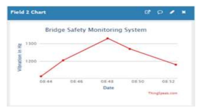
Figure 3: thingspeak graph for vibration sensor