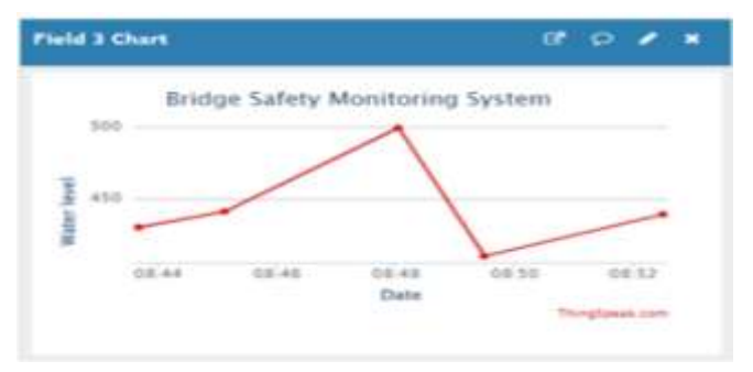
Figure 4: thingspeak graph for ultrasonic sensor