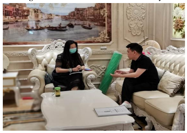
Figure 5 Interview the boss Noted: shot myself

The result of the interview found that the boss did not attach importance to the interior design, what he saw was: as long as there was some display at the door, more stalls appeared, there was no in-depth elaboration on the characteristic culture of introducing Zhang Fei meat, and the interior of the storefront took into account the economic cost, i don't want to get too involved