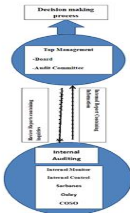
Figure (2). Role of Internal Auditing in Decision Making