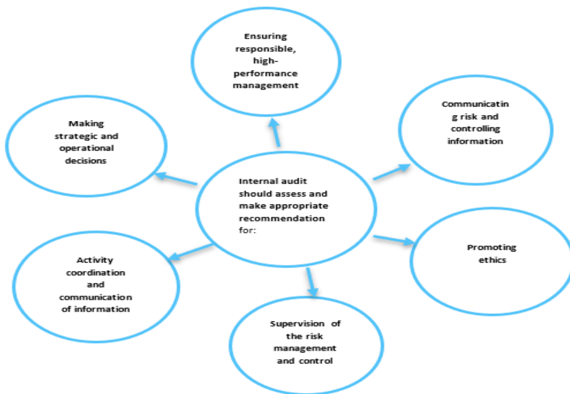
Figure: (1) Internal Auditing and Governance