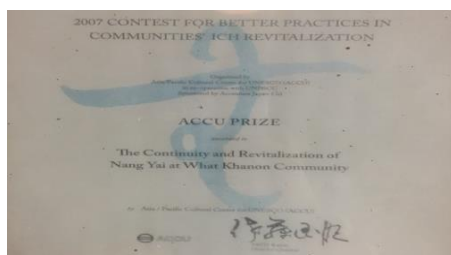
Picture1 :ACCU PRIZE