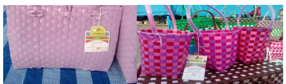
Figure 6 The product's brand

To design a brand, the entrepreneurs integrated cultural capital and community identity into the brand design, the results are shown in Figure 6 .