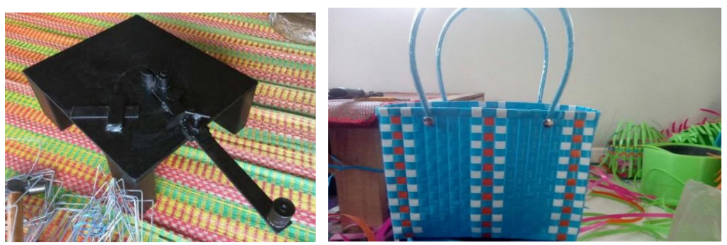
Figure 9 The machinery labor-saving support

A set of equipment was developed with the purpose of labor-saving support. The machinery labor-saving support is shown in Figure 8.