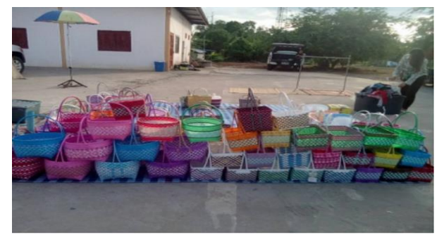
Figure 8 Developed products

Figure 8 presents some developed products. They could produce a higher number of goods with more various designs. This led to more economic opportunity for the community such as higher revenues, more recognizable products, and wider markets. The key factors to this success are brand creation, product distinctiveness, and higher productivity, partly due to the developed local machinery support.