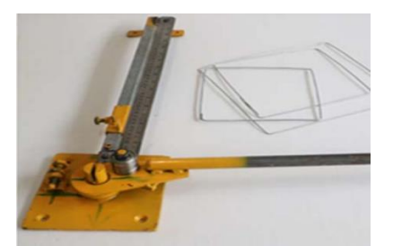
Figure 4 Labor-saving machinery tools for bending the wire frame

As the Kutthong plastic weaving production group wished to develop a machine to save labor in production, the wire utilized in the production process must be particularly strong. In order to strengthen the basket construction in step 6, it is challenging for the weavers to put the bent wire rod to the required location. In addition, it is rather difficult to bend the wire to the necessary size, proportion, shape, curve, and angle because the weavers' traditional tools are only wire cutting pliers. Possessing adequate strength and expertise is required. It should be mentioned that all the manufacturers and weavers are female. As a result, labor-saving machinery is required for them to make bending wire steel frames easier. Labor-saving machinery tools for bending the wire frame are presented in Figure 4