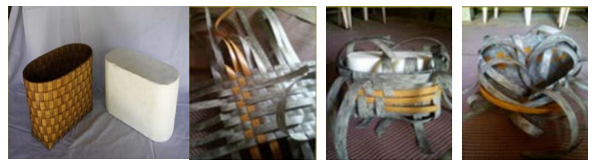
Figure 3 A proposed innovative set of "equipment"

Figure 3 presents an innovative set of equipment for erecting the structure and weaving of plastic strands. This equipment can speed up the production process, which benefits trained weavers by reducing their workload and production time by thirty minutes per piece and makes it simple for others of the community who lack experience to learn.