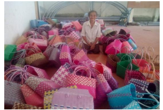
Figure 5 Diverse products made of combined materials

Previously, the group use only plastic strands imported from other areas. After the manufacturers adopted the consultants' advice to use discarded drinking water bottles, the creation of plastic strands from the discarded materials to be combined with other plastic strands results in more diverse patterns and designs that set the products unique apart from both their original products and other items available on the market as shown in Figure 5.