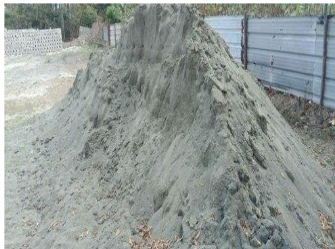
Fig. 3: Quarry dust.

It is obtained from the screenings left from the crushed stone. It is a byproduct in Quarry stone crusher plants. Nowadays, this is being used as fine aggregate because of the difficulty in getting natural sand. Special crushers are introduced in India for making fine aggregate from rocks. In the present work QSD from existing crushers which is a byproduct was used. Stone dust is a multipurpose material for yard construction. A compacted layer of stone dust is well suited to a yard or passageway surface. It is also a great choice for the sub-base in laying paving blocks and slabs, and for jointing natural stone, such as slate. As a stone dust surface is extremely compact and waterproof, banking must be taken into consideration during installation. Properties of Stone dust is a by-product of crushing, with a typical grain size of 0 – 3 to 4mm or 0 – 6 to 8mm. Because stone dust contains very fine mineral aggregates (grain size 0mm), it forms a hard, load-bearing surface.