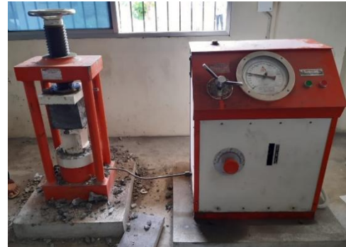
Fig. 7: Compressive Strength test of cube sample.

universal testing machine after 7 days, 14 days and 28 days of curing. Load was applied gradually at the rate of 140kg/cm 2 per minute till the specimens failed. Load at the failure was divided by area of specimen and this gave us the compressive strength of concrete for the given sample.