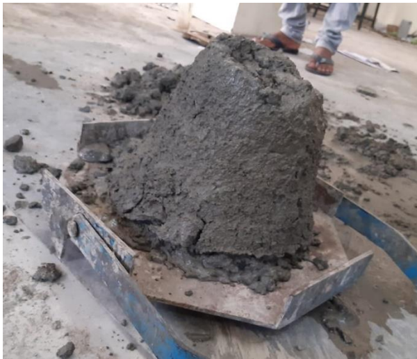
Fig. 6: Slump cone test.

which can be employed either in laboratory or at site of work. It is not a suitable method for very wet or very dry concrete. It does not measure all factors contributing to workability, nor is it always representative of the placability of the concrete. It is not a suitable method for very wet or very dry concrete. It does not measure all factor contributing to workability. The slump test was carried in accordance with B.S:1882 PART2:1970.