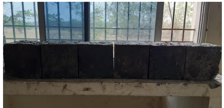
Fig. 4: Concrete mould after demoulding.

The samples were then stripped after 24hours of casting and are then be ponded in a water curing. As casted, a total of (63) 150×150×150mm cube specimens were produced.