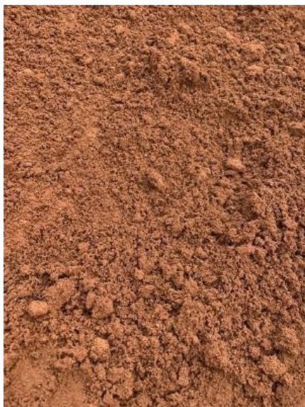
Fig. 2: Brick dust.