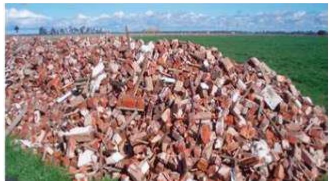
Fig. 1: Constructional waste.

methods there-by putting harsh pressure on scarce urban land as well as dropping life spans of landfills.