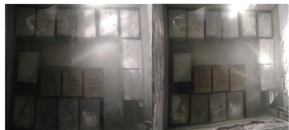
Fig. 5: Water curing.

The method of curing adopted was the ponding method of curing and produced samples were cured for cubes at 7days, 14days, 28 days and beams at 28days.