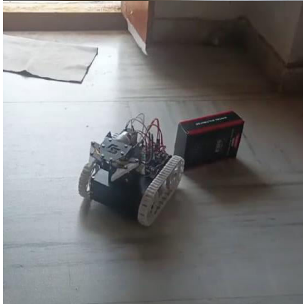
Fig 4 : Pick and Place robotic vehicle using Arduino moving the object from one place to another place.