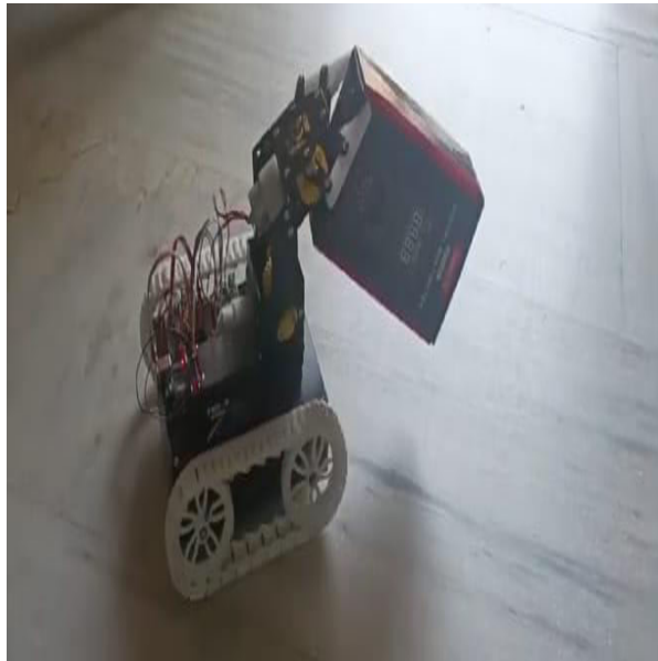
Fig 3 : Pick and Place Robotic Vehicle using Arduino picking the object from one place.