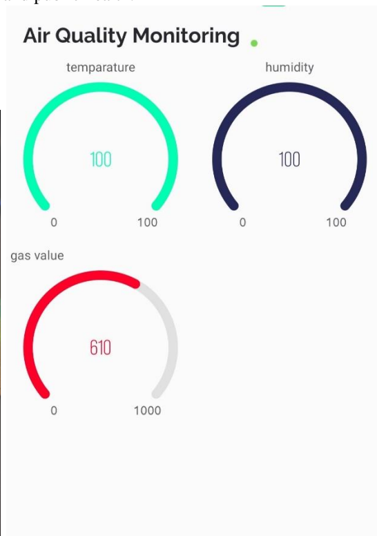
Fig: Air Quality in Blynk IOT