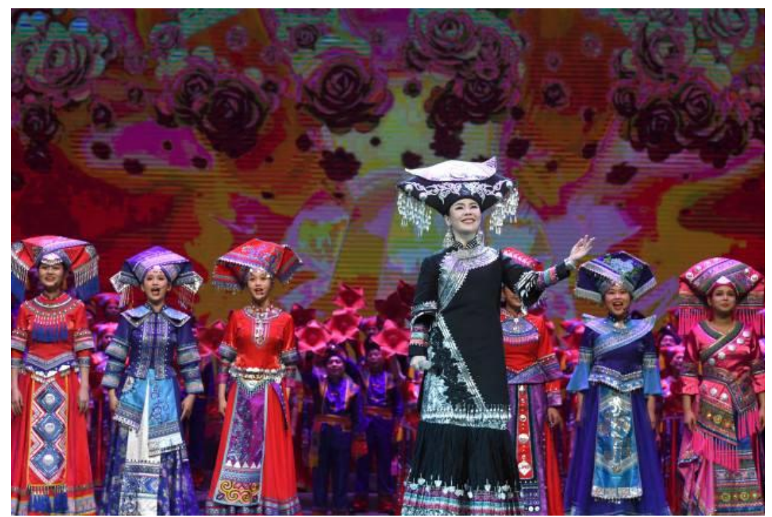
Figure 3. The scene of singing Liaoge song of Zhuang nationality in the evening party named Twelve sounds of nature, Liaoge song of Zhuang nationality.

Fancy embroidery and the use of color contrast are the major feature for Zhuang traditional clothing. Blue and black are the main colors of its clothing, whether it is the overall black or blue Chinese blouse with black long skirt, both have distinct national characteristics, especially the slightly loose Chinese blouse with small stand collar and the design details of seven-minute sleeves, giving the clothes the beauty and delicacy of traditional clothing. The blue edge of the black long skirt also brings the skirt the beauty of contrasting colors, making the whole more elegant. Like the black edge of jacket sleeves, besides the contrastive beauty, it is also easy to see the natural freshness of cotton and linen fabric and the pastoral style.