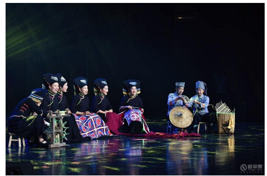
Figure 3. The scene of singing Liaoge song of Zhuang nationality in the evening party named twelve sounds of nature, Liaoge song of Zhuang nationality.

In their clothes, fine embroidery has always been the brightest part, no matter on the sleeves and lapels, or on the skirt's hemline and skirt edges, it could be found embroidery patterns of different details. These embroidery in amazing colors add infinite charm and sparkle to the dark blue and black, and such a combination of low and high profile let people know at first sight that this is the traditional dress of the Zhuang nationality. The shape of the top and skirt can not only lengthen the proportion of the figure, but also make the overall sense of elegance more attractive.