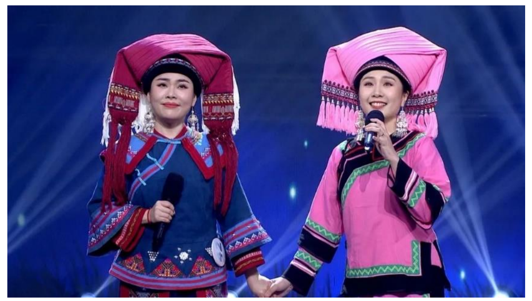
Figure 1. the performance photo of The Stars Accompanied the Moon Res Militaris , vol.13, n°3, March Spring 2023

The singing style of contemporary folk songs is basically solo. The national vocal music works of Zhuang nationality absorb the common singing methods of two-part duet, male and female duet and group singing. For example, The Stars Accompanied the Moon interprets the collision between the original folk song and the new folk song with a duet, just like the picture of a Zhuang girl singing in antiphonal style in the mountains.