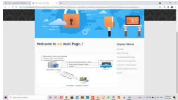
Fig 4.3 owner main page