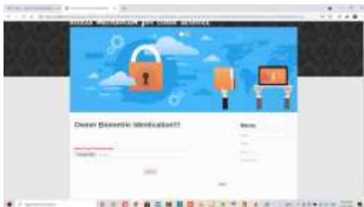
Fig 4.2 in this page owner needs provide biometric image for login if the image is correct then owner can view his actions