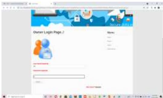
Fig 4.1 Owner Login Form