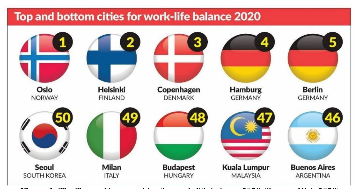
Figure 1. The Top and bottom cities for work-life balance 2020

According to The Organisation for Economic Co-operation and Development (2020), seeking an acceptable balance between work and everyday life is a challenge faced by every worker. Work-life balance is an ideal balance of working and personal life for an individual. In other words, work-life balance refers to the actions, decisions, and responsibilities that determine how much time is spent on work and the rest of their life (Horne, 2019). It is a philosophy in which a worker's happiness is a source of job satisfaction and a motivator for productivity. The concept of work-life balance is considered to be one of the fundamental components of a balanced work environment (Kohll, 2018). Work and life balance are two important factors in people's working lives. Balancing work and personal life are regarded as a traditional work-life balance problem (IONOS, 2019).