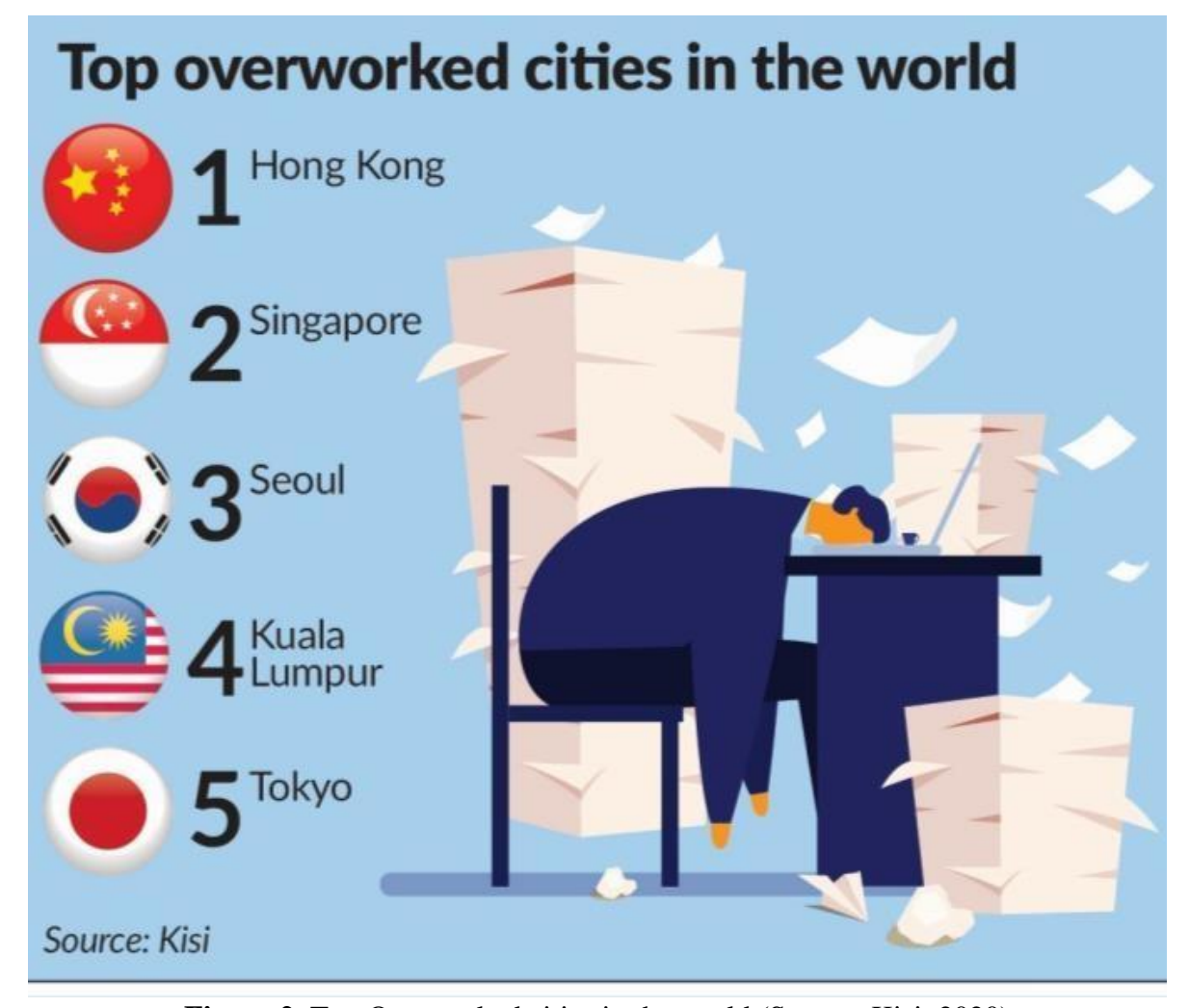
Figure 2. Top Overworked cities in the world

in Norway lead the world in work-life balance, followed by Finland, Denmark and Germany. South Korean are among those most struggling with their work-life balance. The Italian staying in Milan was listed 49th and the Hungarian who stayed in Budapest was listed 48th and also did not completely balance their work-life. Besides, Malaysia is ranked no 47 out of 50 with a low work-life balance, and Argentina is in the ranking no 46<sup>th</sup>. As per Figure 2, Hong Kong is the top overworked city globally. Other Asian countries like Singapore and Seoul ranked 2<sup>nd</sup> and 3<sup>rd</sup> in the top overworked cities. Kuala Lumpur, Malaysia is listed 4<sup>th</sup> and followed by Tokyo in 5<sup>th</sup> rank. According to Kisi (2020), Kuala Lumpur is ranked number one globally as Malaysian take a total of 52 hours to commute and work per week. It led Singapore, whose staff averaged 51.1 hours a week, followed by Bangkok with 50.7 hours per week. Despite the longest hours worked and commute per week, Kuala Lumpur was in the top 4 cities with the overworked population. Hong Kong is the highest overworked population, with 29.9%, which shows that most workers work more than 48 hours per working week. Singapore ranked second with 25.1% and followed by Seoul with 23.1%. Besides, Kuala Lumpur ranked number 4, with 21% of overworked workers. Additionally, Malaysia is number 3" fewest vacations day offered" with many taking only 12 days off per year (Kisi, 2020).