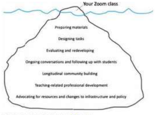
Fig. 1. The ordine teaching inchery (Firens et al., 2021b, p. 22b)

complex and uncertain situations, which are likely to require sustained and, often, invisible work, away from the simpler and more obvious concerns of teaching sessions. This is particularly challenging where different values are in tension (e.g., inclusivity is often at odds with rhetoric of efciency), and in the context of a fast-moving educational landscape in which new technologies are continuously introduced and abandoned. As bussey (2021) notes, integrating technology into the various educational and administrative practices of teaching can place considerable pressure on teachers. The 'digital capability' of educators also includes recognition of when complicated technology is unnecessary, as a simple one would do. Further, efective teaching in hybrid spaces is a complex, skilled activity that inevitably involves multitasking, carries extreme cognitive load, and needs to be performed publicly in front of students under pressure and stress (mackenzie et al., 2021; raes et al., 2020).