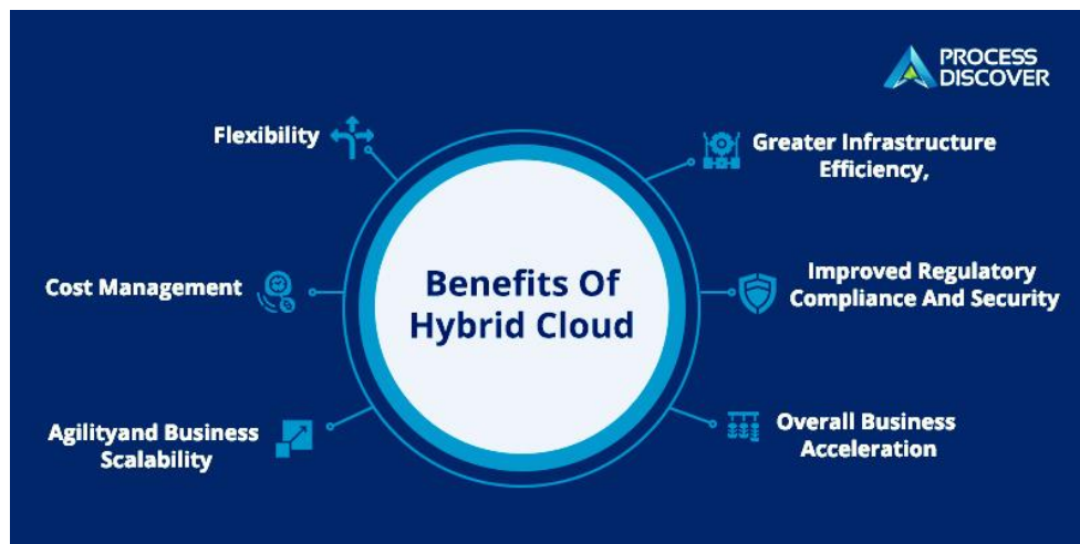
Fig.1. Benefits of Hybrid Cloud.

Multi-Cloud Interoperability: Many agencies are adopting a multi-cloud method, utilizing offerings from a couple of cloud carriers. Researchers may want to be cognizant of the demanding situations and solutions for reaching seamless interoperability between distinctive cloud structures within some hybrid surroundings.