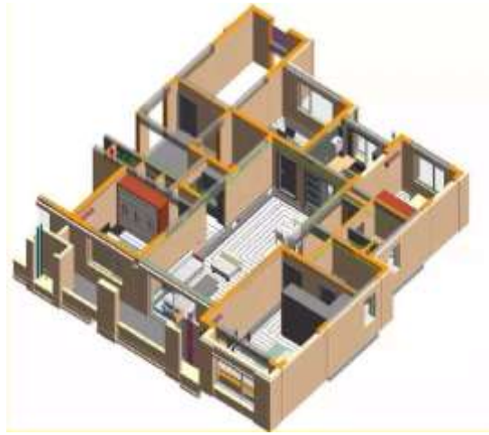
Figure4. Prefabricated building design

In addition to the wall surface, the exterior windows of prefabricated buildings have also changed. In the construction of exterior windows, we can no longer rely solely on the traditional single-layer glass, and we need to choose double-layer hollow plastic-steel window glass to satisfy the use of exterior windows of prefabricated buildings and achieve better thermal insulation effect. At the same time, the floor treatment of prefabricated buildings is quite different from that of previous buildings, and it is necessary to consider the suitable materials needed for different floor thicknesses in the selection of materials. The operation and management process of green buildings touches on many aspects of building envelope, water supply and drainage, HVAC, electrical, renewable energy, environmental greening, garbage disposal, traffic safety, etc. The following two points are mainly used for renewable energy and measurement and testing equipment. There are many differences with traditional buildings, and more standardized requirements are put forward for operation and management. Therefore, these two requirements are listed as special items. The technical content includes the operation and maintenance of renewable energy and measurement and testing equipment, optimization, and data collection and analysis of testing equipment.