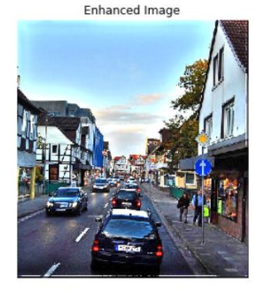
Fig. 3: Illustrating the obtained enhanced images using proposed model with quality metrics as PSNR, SSIM, and MSE.

Figure 3 displays a set of images that have been processed or enhanced by the proposed image enhancement model. These are the output images that produces improved visibility and quality of these images compared to the original low-light images shown in Figure 1. It also includes quality metrics such as PSNR, SSIM, and MSE, which are used to quantitatively assess the quality of the enhanced images. These metrics are numerical values that provide insights into the image quality, with higher PSNR and SSIM values and lower MSE values indicating better image quality. The purpose of this figure is to visually demonstrate the effectiveness of the proposed image enhancement model by showing the enhanced images and providing quantitative metrics that measure the improvement in image quality.