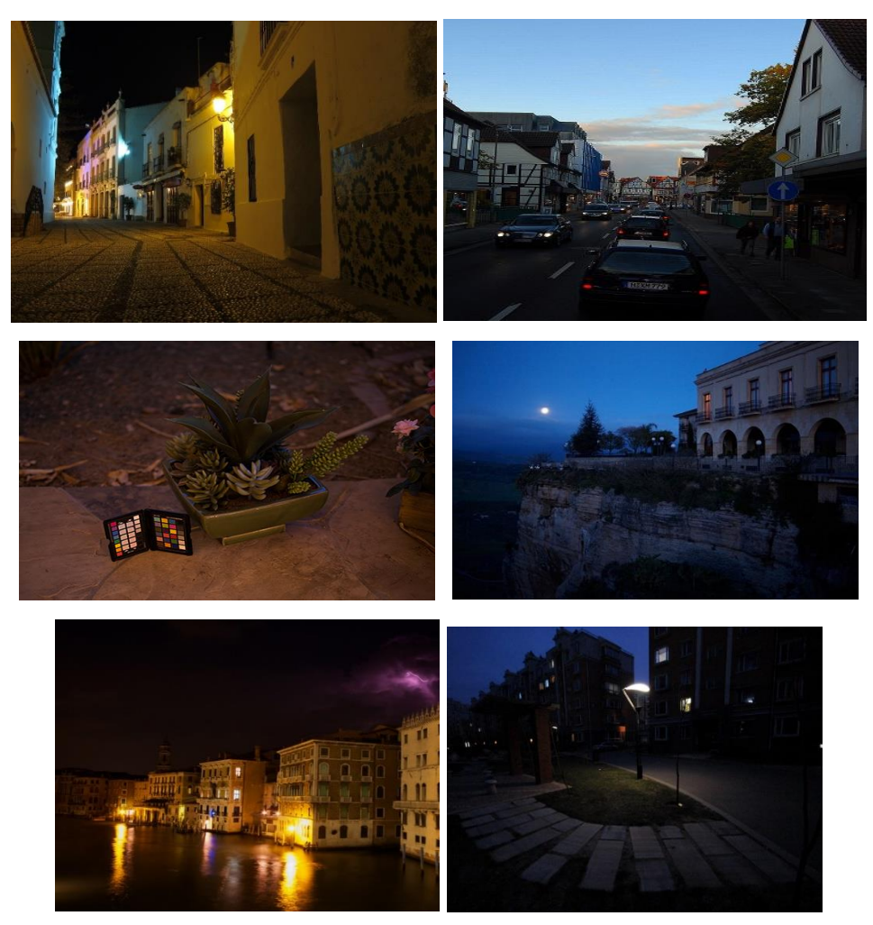
Figure 2: Sample low-light images fed to the proposed model.

Figure 2 shows a collection of original images that are taken in low-light conditions or have poor lighting quality. These images serve as the input to the proposed image enhancement model. These images are the input images that the model will process in order to improve their visibility and quality. The purpose of this figure is to provide a visual representation of the types of images that the model is designed to enhance.