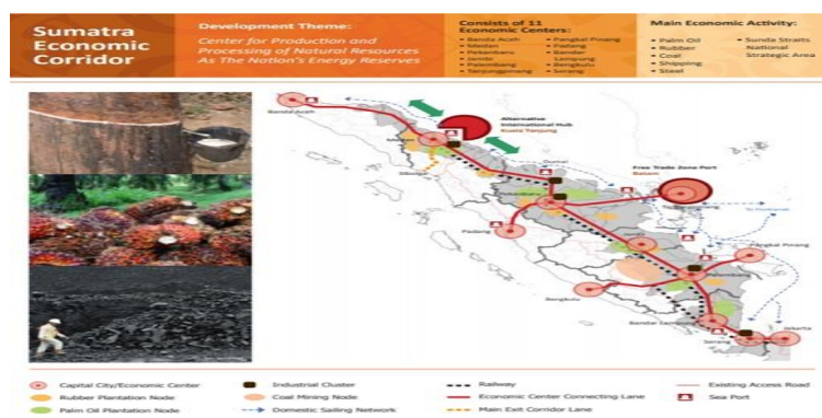
<Fig. 1> Projection of Sumatra Island's Economic Potential Mix (Ministry of National Development Planning of the Republic of Indonesia / National Development Planning Agency 2011)

Based on data from the Central Bureau of Statistics (BPS), it shows that Sumatra Island ranks second in Indonesia in terms of the speed of regional development, as evidenced by the figure for Gross Domestic Product, which touched 23.8% in 2018 of the total Indonesian GDP. The Gross Domestic Product figure of Sumatra Island is only inferior to Java Island as an area that has the highest Gross Domestic Product figure of 57.6%. It makes sense because, according to the Central Bureau of Statistics of Republic Indonesia (2018), Java Island is the center of economic and trading activities in Indonesia. It is hoped that the enormous potential of Sumatra Island can be used to support Indonesia's development through accelerating economic growth and the distribution of infrastructure development. So, it is hoped that it will help the island of Sumatra become a financial hub where people from Europe, Africa, South Asia, East Asia, and Australia can get to markets (Hutama Karya Co. Ltd.).