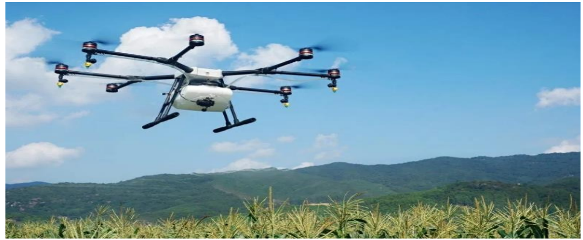
Figure 1. Illustrates the Pesticide Spraying Drone Robot for Various Agricultural Activities.

Drone usage in agriculture has moral and societal repercussions. They can effectively monitor and manage the usage of pesticides, which is one advantage. This enables reducing the negative effects of pesticides on the environment. However, drones flying under 400 feet above ground level do not need authorization to do so (120 m). Drones may be equipped with microphones and cameras, which has led to some criticism due to worries about potential privacy violations. Other businesses could start using drones to examine their rivals, the health of their crops, and agricultural output in unrestricted regions [7]–[9].