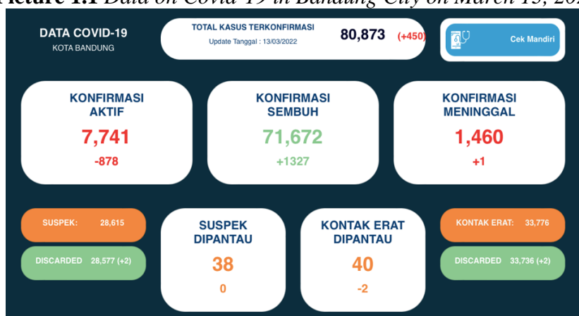
Picture 1.1 Data on Covid-19 in Bandung City on March 13, 2022

Source: https://covid19.bandung.go.id , 2022