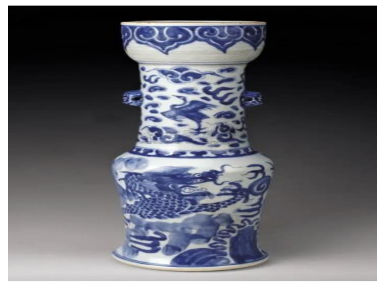
Figure 6 The space effect of folk blue and white tableware pattern. A Qing shunzhi blue and white vase with cloud and dragon wash mouth and animal ears

The spatial treatment of the interior of the bowl is generally the same as that of the dish, and the folk blue and white dish ware pattern is mainly considered from the spatial effect of the circular plane, together with the requirements of use, generally decorated in the inner parts, with extremely simple borders, leaving a large number of gaps between them. The contrast between sparse and dense, and between real and imaginary, should be created. Some even leave a large area of white space, using the void for the real, creating an ethereal pattern of more white than blue. Secondly, in the seventeenth century, the composition of folk blue and white was 'programmed'. Like the Chinese Peking opera, where a whip in the hand is a horse, for example, a circular line of ware, what ground is used and what picture is used are all programmed, like the 'three stops without eyes' in Western painting. As in Figure 6.