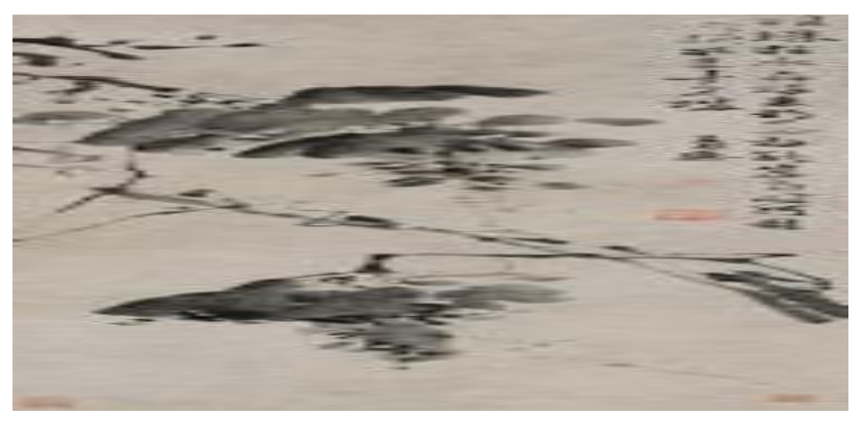
Figure 3 Xu Wei ink grapes (in the Palace Museum)

Literati painting attaches great importance to composition, to the idea of the brush first and to figurative thinking, and to the unity of subject and object in the artistic image. In terms of composition, literati painting is all about management, not based on a fixed space or time, but in a flexible way, breaking the limits of time and space, rejecting objects in different times and spaces and repositioning them according to the painter's subjective feelings and the laws of artistic creation, constructing a space-time realm in the mind of the artist. As a result, the wind, rain and snow, the four seasons of the day, the ancient and modern figures can appear in the same painting. In terms of perspective, it is also not bound to focal perspective, but uses multi-point or scattered perspective, moving up and down or left and right, back and forth, to view objects and manage the composition, with great freedom and flexibility. At the same time, in the composition of a painting, it is important that the painting be 'sparse enough for a horse to walk' and 'dense enough for the wind to penetrate', and that there be reality in the void and reality in the void, as shown in Figure 3.