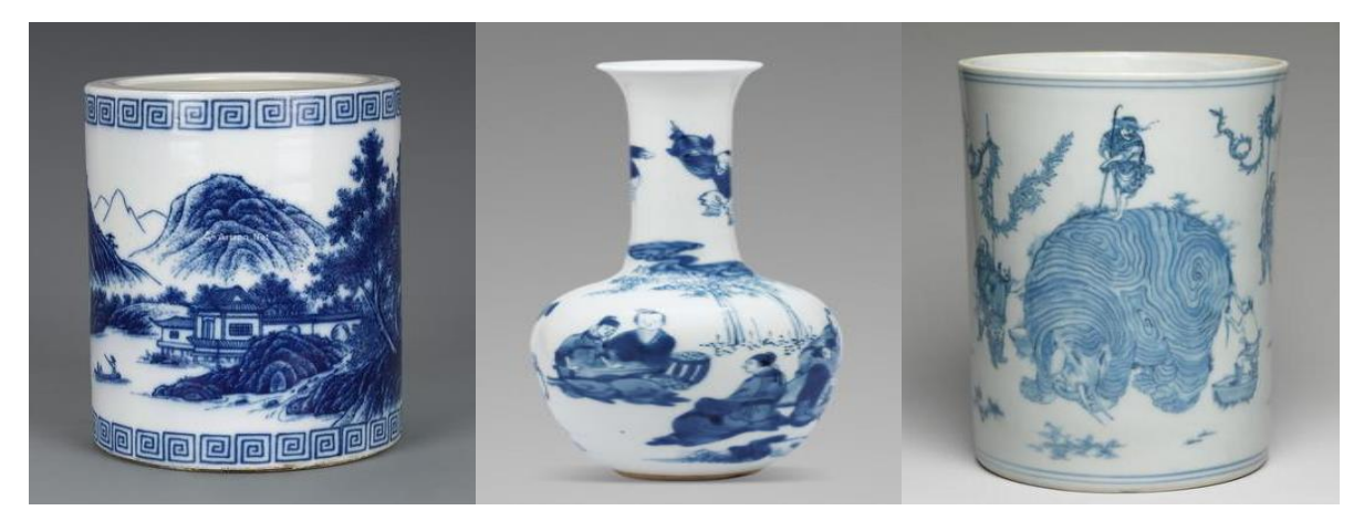
Figure 8 Chongzhen blue and white brush pot with elephant design (partial) (a) Blue and white frame. (b) Clouds and Rocks. (c) Open light Res Militaris, vol.12, n°3, November issue 2022

The treatment of the image also differs from that of literati painting in the seventeenthcentury folk blue and white, for example by the use of V-shaped symbols for grass, which is not found in literati painting. For example, the painting of the brushpot in Figure 8 (a) has a typical seventeenth-century folkloric blue and white frame, with a cluster of V-shaped symbols representing grass, which is decorative in nature. Secondly, the rock is divided into many layers, often with a 'back' that separates the two ends of the picture with curling clouds and steep rocks, a form that solves the problem of how to represent a painting on paper on a rounded object as in Figure 8 (b). "Once again, the 'open light' decoration is also characteristic of this period, as in Figure 8 (c). 'Open light' is also known as 'open tangzi' among the old artists in Jingdezhen, and is one of the common methods of decoration in ceramic art. It has the characteristics of highlighting the contrast of the subject and moving in a static village. In order to make the decoration on the object varied, or to highlight a certain image, a certain shape is often left in a certain part of the object.