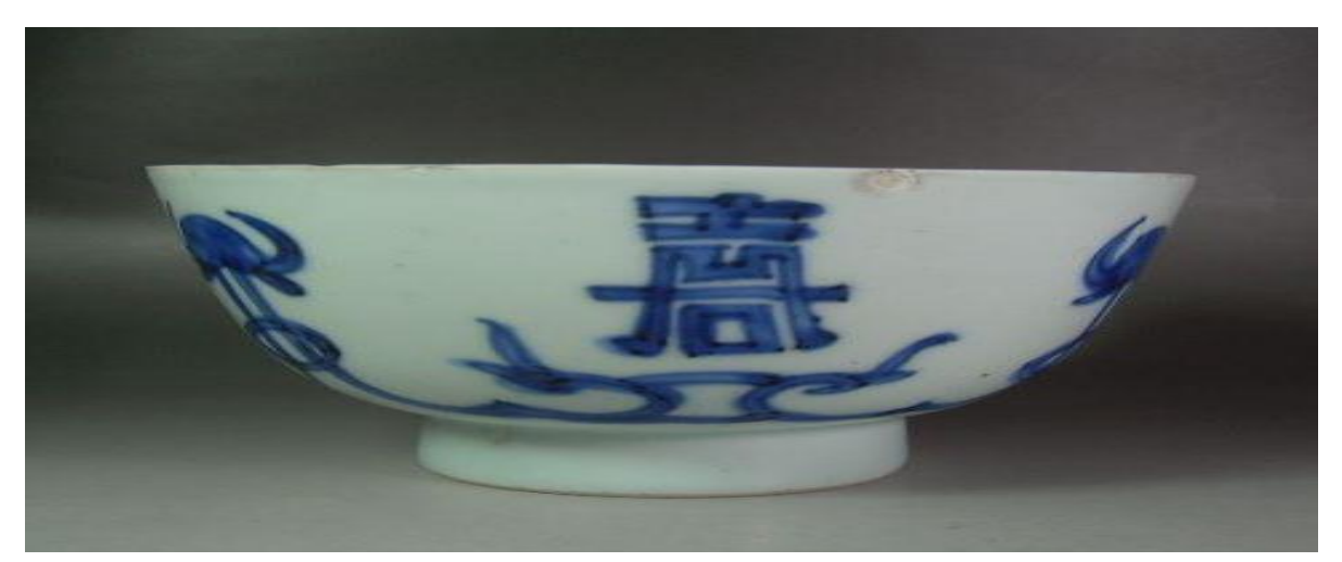
Figure 5 An early Qing dynasty blue and white bowl with the character Shou (longevity)

As a large number of the folkloric blue-and-white panels of the period are found on everyday products, such as bowls, plates and dishes, the composition is usually in the form of a two-sided continuous decoration. For example, bowls are generally decorated on the outer wall of the vessel, and the decorative parts of the outer wall are concentrated in the open space in the middle, with the upper and lower mouth edges and foot edges only considered as a border, and as the bowl forms a hemisphere, the composition seeks a sense of circularity and infinite expanse as in Figure 5.