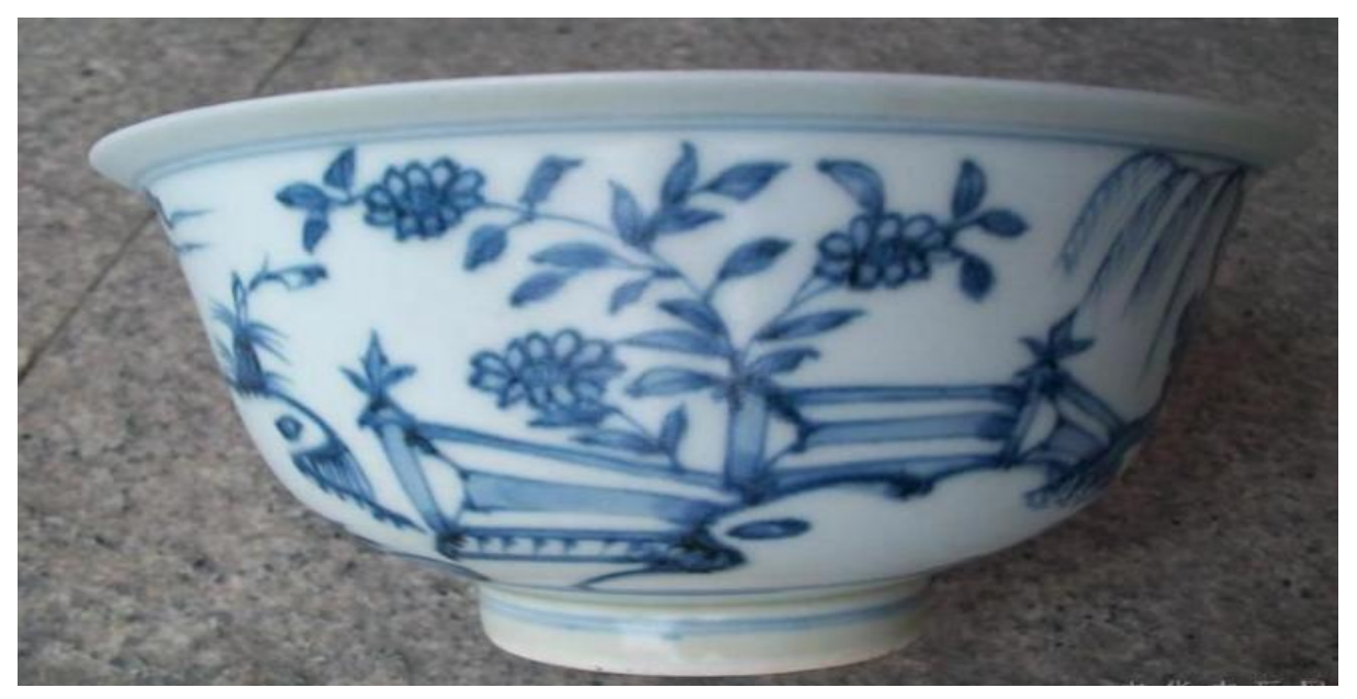
Figure 7 A blue and white bowl with figures, Tianqi