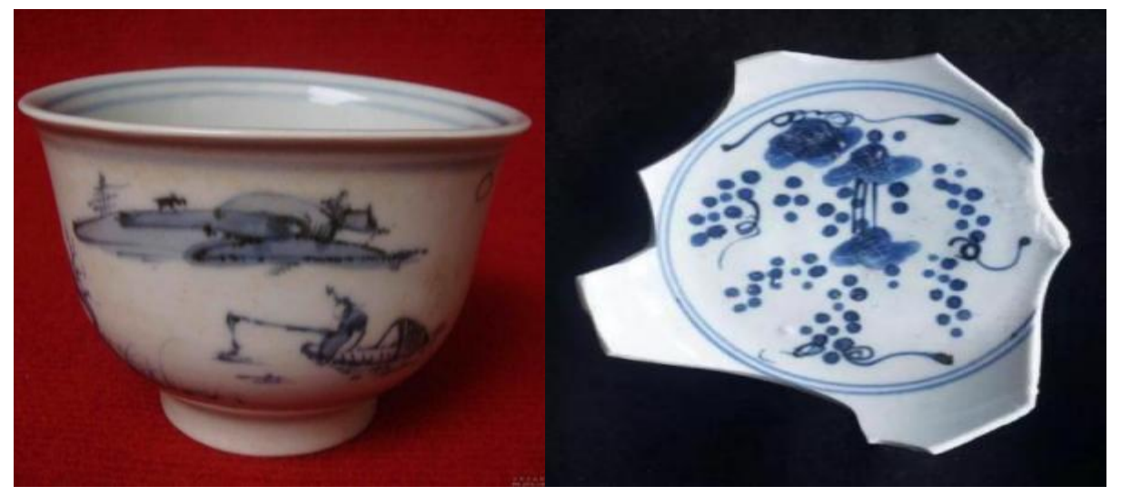
Figure 4 The mood of literati in the late Qing Dynasty

entirely in flat space. There are also the through-view compositions used in literati painting, such as in landscape painting, which are generally used to maintain the ornamental qualities of each angle. There are also scattered and vignette compositions and so on. The composition is often a way of expressing the richness of thought with a minimum of ink and brushstrokes, as in Figure 4, and is an expression of the late Ming literati's apocalyptic mood and relic mentality.