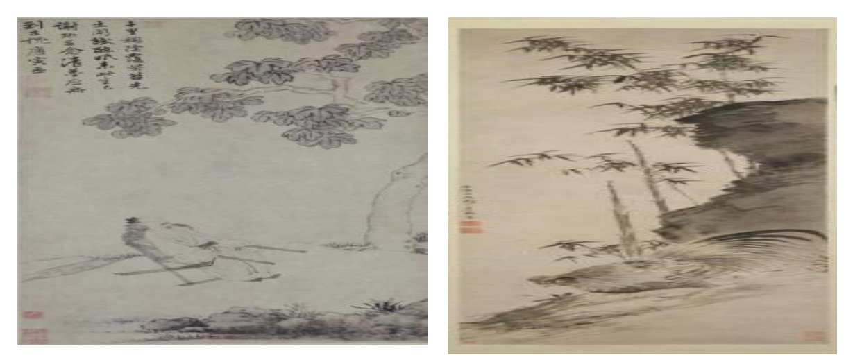
Figure 2 Bamboo Fowl

not originally painted on porcelain, but after creative processing and clever composition, they became images of decorative beauty, with auspicious meanings and complementary illustrations, fully reflecting the aesthetic sensibilities and ideals of the common people, and setting off a profound theme of meaning. For example, the great masters of the Wu school showed a clear distinction between their flower and bird paintings and the style of the palace workshops from the very beginning. As soon as this style began, literati flower and bird painting quickly developed and a number of creative painters emerged, such as Zhou Zhifeng's school of flower and leaf painting and Chen Chun, Xu Wei and Bada Shanren's school of ink and wash painting. The rise of the subject matter of flower and bird painting opened up a new world for the literati painters to express their passions. Zhou Zhifeng's Bamboo Fowl, as shown in Figure 2.