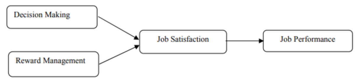
Figure 1. Factors relating to job satisfaction and job performance (Mondy, 2012).

HR personnel is essential in preventing turnovers (Mondy, 2012). By keeping employees motivated, company managers reduce turnover and, at the same time, enhance productivity. This represents a second independent variable (IV) to measure workplace performance or productivity and assess job safety/satisfaction (Muchinsky & Morrow, 1980; Perumal et al., 2019; Melkonian, 2020). Figure 1 illustrates factors linked to job satisfaction and performance (Mondy, 2012). This is linked to career advancement, as it increases proportionally with job satisfaction.