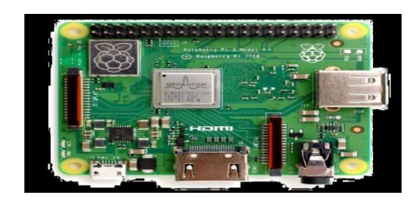
FIG 1 RASPBERRY PI 3A+ 2.2.2 IR SENSOR MODULE:

One of the key features of the Raspberry Pi 3A+ is its compact size. Measuring just 65mm x 56mm, it is considerably smaller than the standard Raspberry Pi 3 Model B+, making it an ideal choice for projects where space is limited. It also has a smaller power footprint, making it ideal for battery-powered projects.