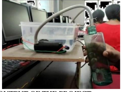
FIG 6 OUTPUT OF THE PROJECT

The main purpose of the project is first we have to set up connections to the desktop to our project with same wiffi connections and after then IP address will display on desktop at VNC viewer App. That IP address we will enter on our laptop at VNC viewer with username and password then it will be open. After we will open file in that file there is thonny app .in that we should run code after running code it will ask say something then we have to say bond after that it will display i got it after that it will ask again say something then we have to say hot or cold water then it will display i got it if u say hot water we will get hot water from water pump motor1 and if u say otherwise cold water and we will get cold water from water pump2 .first we have to fill plastic tub with one side cold water and other side hot water .Hence this output of the project